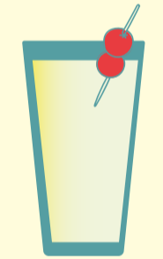
STAY UP LATE 145

Pierre Ferrand, Orange Curaçao, sugar and lemon