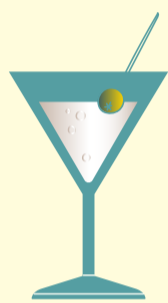
DRY MARTINI 155

Star of Bombay, Noilly Prat and orange bitter