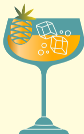
PINEAPPLE DAIQUIRI 145

Bacardi Carta Blanca, mint, lime, sugar and soda