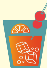
OLD FASHIONED 155