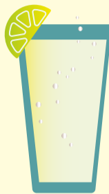
LIMONCELLO SPRITZ 135