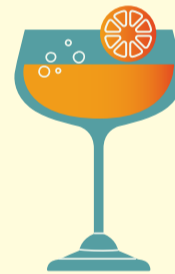
SIDE CAR 145

Absolut Vodka, ginger, mint, lime and ginger beer