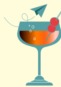
PAPER PLANE 145

Olmecca Altos, Orange Curaçao, sugar and lime