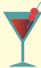
RED HOOK 155

Michters Rye, Punt E Mes and Luxardo maraschino