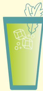
VOD VOD MULE 145

Martini Fiero, St Germain Star of Bombay and apple