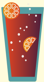
NEGRONI SBAGLIATO 135